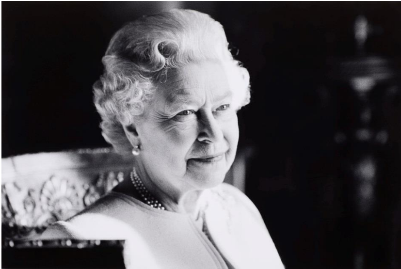
Queen Elizabeth II 1926-2022

The Chartered Institute of Logistics and Transport in North America mourns the passing of Her Majesty Queen Elizabeth II. Her remarkable life of grace and service will forever remain an inspiration to people across the globe. Our thoughts are with her family, especially our Institute's Royal Patron, HRH The Princess Royal.