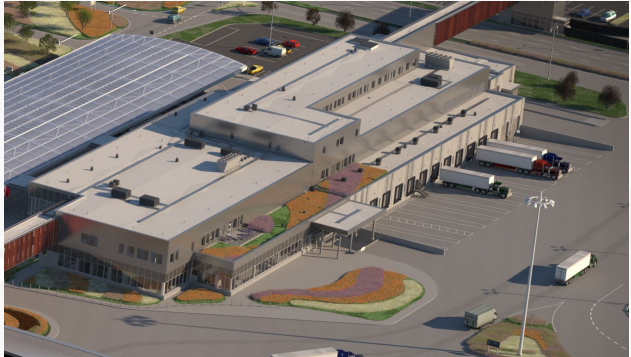
Commercial inspection building: 14 secondary inspection bays for transport trailers, and 37 parking spaces for transport trucks