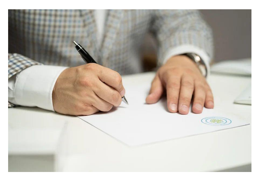
Synergenics Consulting presents "Electronic Trade Documentation" virtual workshop on Friday, May 2 at 3 pm PT.

Don't miss out! Access the program and secure your spot at https://supplychainus.com/